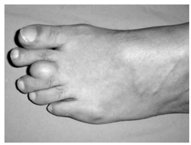
Figure 1. Clinical view of the soft-tissue mass in the second web space.

revealed a lipoma characterized by mature adipocyte clusters separated by well-vascularized collagen bundles showing myxoid degeneration (Figure 5). The postoperative healing was uneventful. At three month's follow-up, there was no hypoesthesia and no mechanical discomfort and the patient could wear proper footwear.