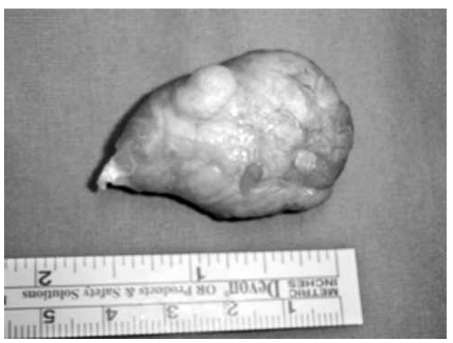
Figure 4. Well-defined, encapsulated mass after excision.