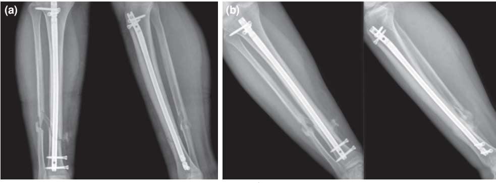
Figure 2. (a) Postoperative second week and (b) 12<sup>th</sup> week controls (time until union) anteroposterior and lateral radiographs of a 22-year-old male patient with a diagnosis of Orthopaedic Trauma Association 42B tibial diaphyseal fracture who underwent distal locked tibial intramedullary nailing.

locking screws, and two distal locking screws with single blocking screw, authors observed that three distal locking screws were superior to other groups with improved axial construct stiffness.<sup>[12]</sup> However, they found no significant difference between groups in rotational stability.<sup>[12]</sup> In this study, we experienced that conventional tibial IM nail with two distal locking screws provided a more rigid fixation when compared to talon tibial IM nail with four talons since we observed that bridging callus of talon tibial IM nails were more visible in radiographs than distal locked tibial IM nails. Besides, the mean time until union in talon tibial IM nailing group was four weeks longer than distal locked tibial IM nailing group, which also indicated the reduced stability of fixation.