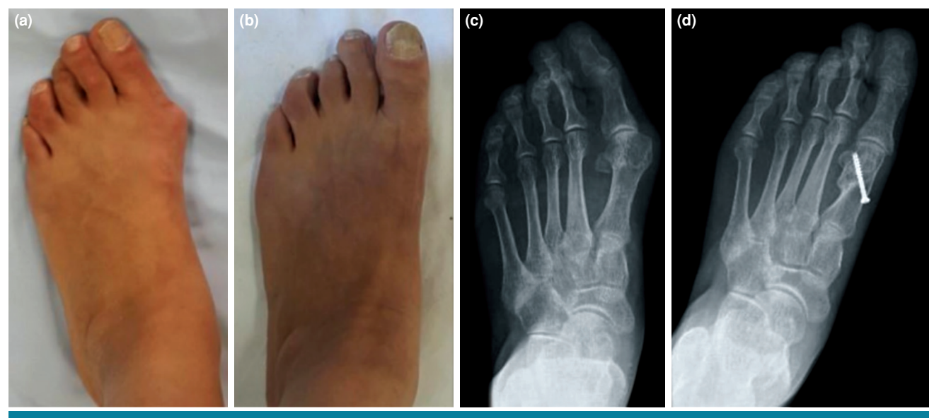
FIGURE 3. Fifty-one year old woman operated for hallux valgus deformity. (a) Preoperative AP weight-bearing view. (b) Postoperative AP weight-bearing view at last visit. (c) Preoperative AP weight-bearing X-ray. (d) Postoperative AP weight-bearing X-ray at last visit.

obtained between pre- and postoperative pain, function, and alignment sections of the AOFAS/ HMIS. In the footwear section of the AOFAS/HMIS, the median preoperative score of 5 (range, 0-5) increased to 10 (range, 5-10) in the postoperative period (p=0.001) (Table II).