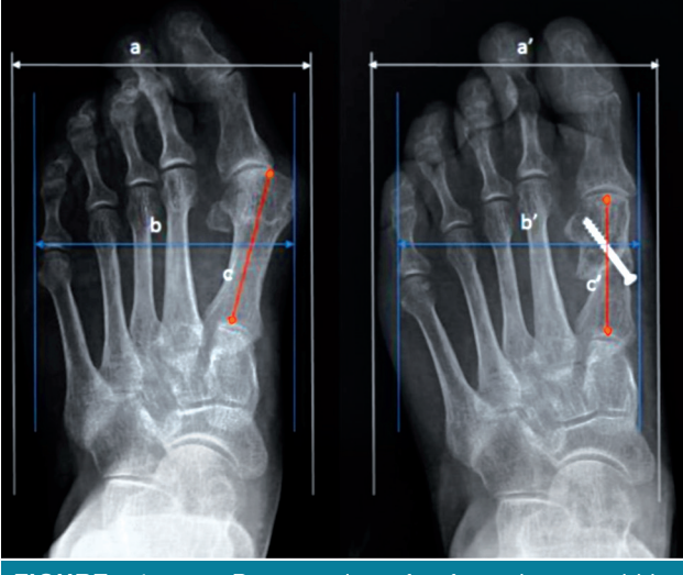
FIGURE 1. a: Preoperative forefoot bone width, a': Postoperative forefoot bone width, b: Preoperative forefoot soft tissue width, b': Postoperative forefoot soft tissue width, c: Preoperative first metatarsal lenght, c': Postoperative first metatarsal lenght.

The patients were placed in the supine position on the operating table. Under an ankle after pneumatic tourniquet was applied, dorsomedial approach was used over the one third of distal metatarsal. The skin and subcutaneous tissue were incised by straight incision and joint capsule was opened in the form of U-shape (Figure 2a). After the bunion excision, the metatarsal shaft was osteotomized from metatarsal shaft-neck conjunction area at an angle of 30-45° in a distal medial to proximal lateral direction with respect to the first metatarsal length, deformity, and plantar fascia tension (Figure 2b). Sliding on the surface of the osteotomy was achieved not by active manipulation, but by bringing the thumb to the ideal position (Figure 2c). The sliding of the osteotomy site with this method occurred in different amounts according to the soft tissue tension that was different in each patient. Then, the first phalanx remained unsupported in the desired position and no soft tissue tension (particularly plantar fascia) was observed in this position to cause the deformity again. In addition, no additional soft tissue (adductor muscle, lateral capsule, plantar fascia, etc.) release was performed.